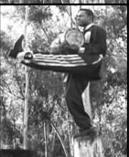
In a demonstration of mind over body this Head National Instructor balancing on a 5' tree stump repeatedly lowers and raises himself on one leg while holding a heavy log.