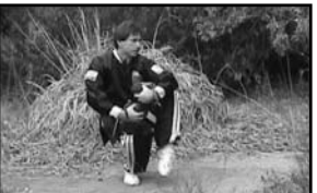
Wae Gong Foundation techniques promote deep muscle and joint strength to the upper, middle and lower areas of the body.