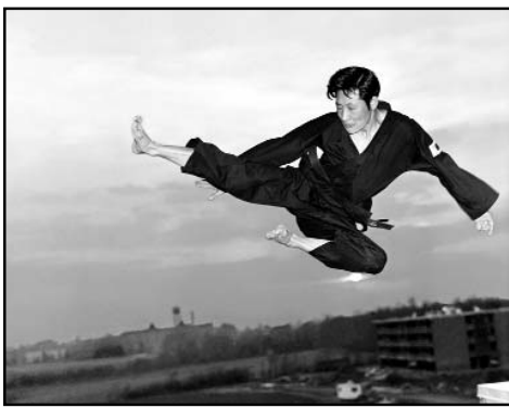
Founded in the US 1972. © 1993

One of the many personal achievements of Grandmaster "Iron" Kim is the Kyong Gong Sul Bope (flying side kick). Above is Grandmaster jumping from the top of a building. (The roof is visible in the lower right corner.) In 1970, Grandmaster "Iron" Kim demonstrated Kyong Gong Sul Bope by jumping from the equivalent of an 11-story building. In 1972, Grandmaster "Iron" Kim again demonstrated the Kyong Gong Sul Bope movement by jumping from the equivalent of an 8-story building both times landing without injury onto a sloped surface below.