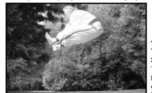
An over 60 year old physician - after treating so many others in his career he is now taking time to take care of and further develop himself. A few years ago tests showed two arteries from his heart were completely blocked, usually requiring emergency surgery. He waited and upon checking further found that his heart was compensating for the blockages. He credited the internal strength he developed through Traditional Moo Doe with allowing his heart to adjust and saving his life. He still has not had the surgery.

California - Florida - Massachusetts Minnesota - Pennsylvania - Washington - Wisconsin