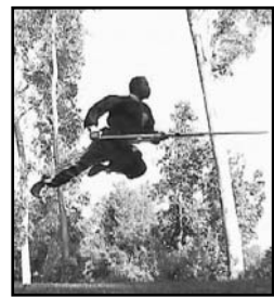
Head National Instructor jumps and turns 180° mid-air to attack with a Chung Sul.

Using internal (Nae Gong) strength, Grandmaster "Iron" Kim pulls a van with a rope in his teeth while pulling a full size luxury car with the right hand, over 50 feet (the car is off camera behind van).