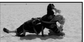
Head Instructor/attorney develops internal strength through Yuk Kun Kyong, supported only by left elbow and right foot.