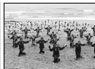
Pal Gye Kwon develops muscle elasticity, deep joint strength, flexibility and coordination.

All humans have the potential to achieve the strength demonstrated in these photos. It has been known throughout history to be nearly impossible to reach the strengths, skills, and abilities seen in these photos without Traditional Moo Doe training. Remarkably, practitioners of all ages from their twenties to their senior years increasingly improve their condition and strength. This training brings the mind, body and movement together as one, leading to a higher spiritual level for greater daily benefits and a lifetime of peace.