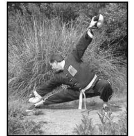
Head National Instructor demonstrates strength and flexibility (agility) in ankles and knees during Tang Bek Bong.