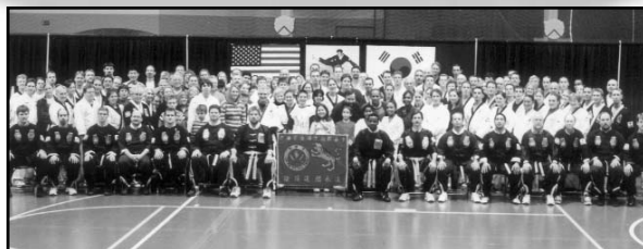
Some of the judges and participants from the Pittsburgh tournament.