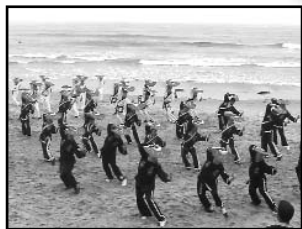
Pu Chae builds flexibility, accuracy of striking exact points, offensive and defensive skills. The mind, body, and movement come together as one.

For further information refer to the 6 panel poster (2 1/2 x 9 1/2 foot in size) which is posted in every licensed Oom Yung Doe school.