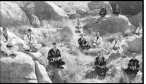
Instructors and students build inner peace and mind over body through meditation