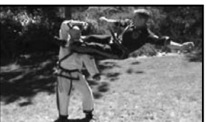
Instructors demonstrate body control, flexibility, coordination, and body strength to catch and flip opponent.