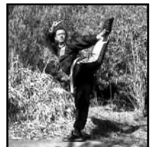
Oom Yung sparring techniques develop the ability to move with exceptional speed and agility, utilizing the hands and feet during offensive and defensive