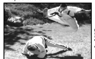
Asst. Instructors practice light sparring techniques with jump kicks and sweeping.