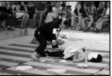
Asian Charity Long Beach, CA. 800 lbs. of rock are smashed into small pieces with a sledge hammer on Grandmaster's stomach. Without concentrating Nae Gong energy to his stomach area, severe injury would result.

I am beginning to understand how Traditional Moo Doe allows me to balance my mind and body to become one, and to use my full strength at will to achieve my goals and overcome the many challenges of everyday life. My quality of life has truly improved and I continue to strive for excellence in all areas. I now understand why higher practitioners throughout history have spent years seeking the teachings and wisdom from the direct line of Traditional Moo Doe